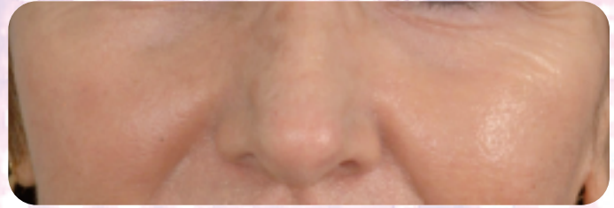
After laser resurfacing in combination with Omnilux plus and Omnilux revive (Derma-K Laser CO 2 , 6 watts, 40% duty cycle, 1.4 J/cm 2 , 12 Hz, 4 mm spot)

menting using the Omnilux in combination with the long-pulse YAG in trying to dissolve fat.