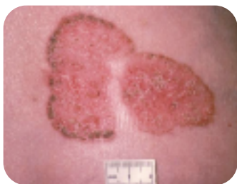
Basal cell carcinoma before Tx