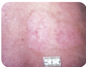
Basal cell carcinoma after Omnilux PDT Tx with 5-aminolevulinic acid